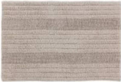
Bahamas - Stripes beige | 190 006