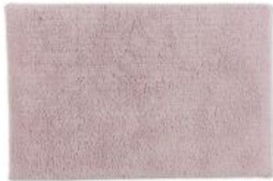
Bahamas - Uni rose | 190 015