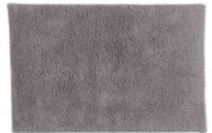
Bahamas - Uni light grey | 190 042