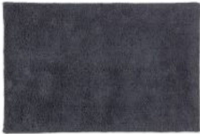
Bahamas - Uni anthracite | 190 040