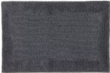
Bahamas - Border anthracite | 192 040