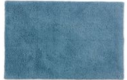
Bahamas - Uni light blue | 190 023