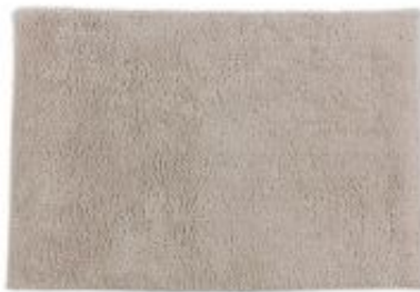
Bahamas - Uni beige | 190 006