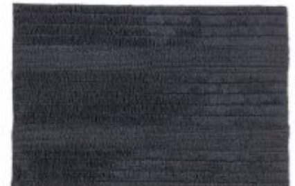
Bahamas - Stripes anthracite | 191 040