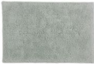
Bahamas - Uni mint | 190 037