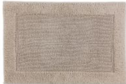
Bahamas - Border beige | 192 006