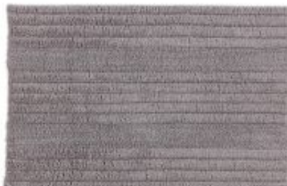
Bahamas - Stripes light grey | 191 042