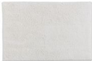
Bahamas - Uni cream | 190 000