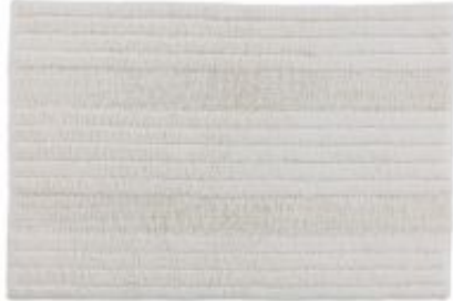
Bahamas - Stripes cream | 191 000