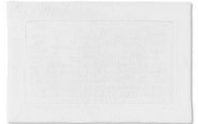
Bahamas - Border cream | 192 000